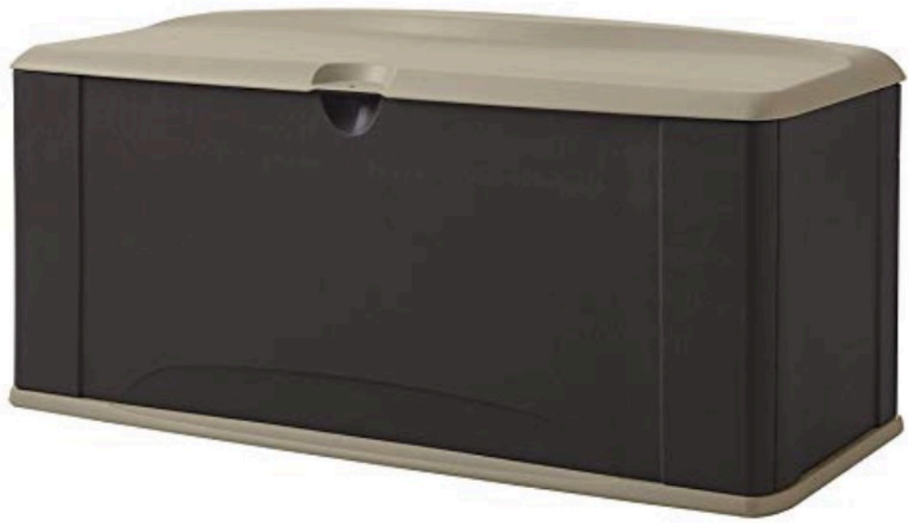
Rubbermaid Extra Large Deck Box, Roughneck